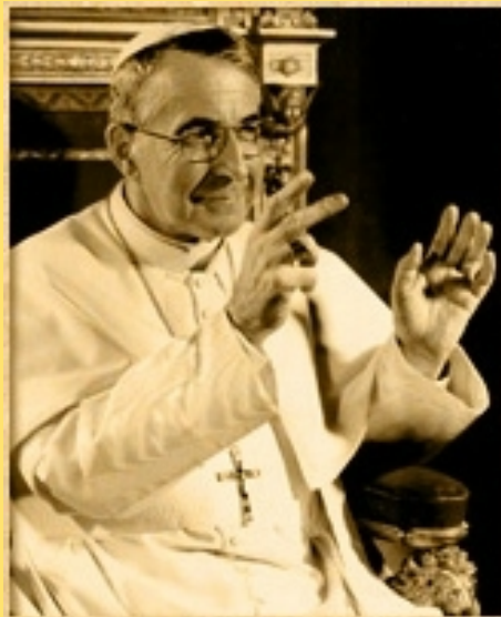
John Paul I