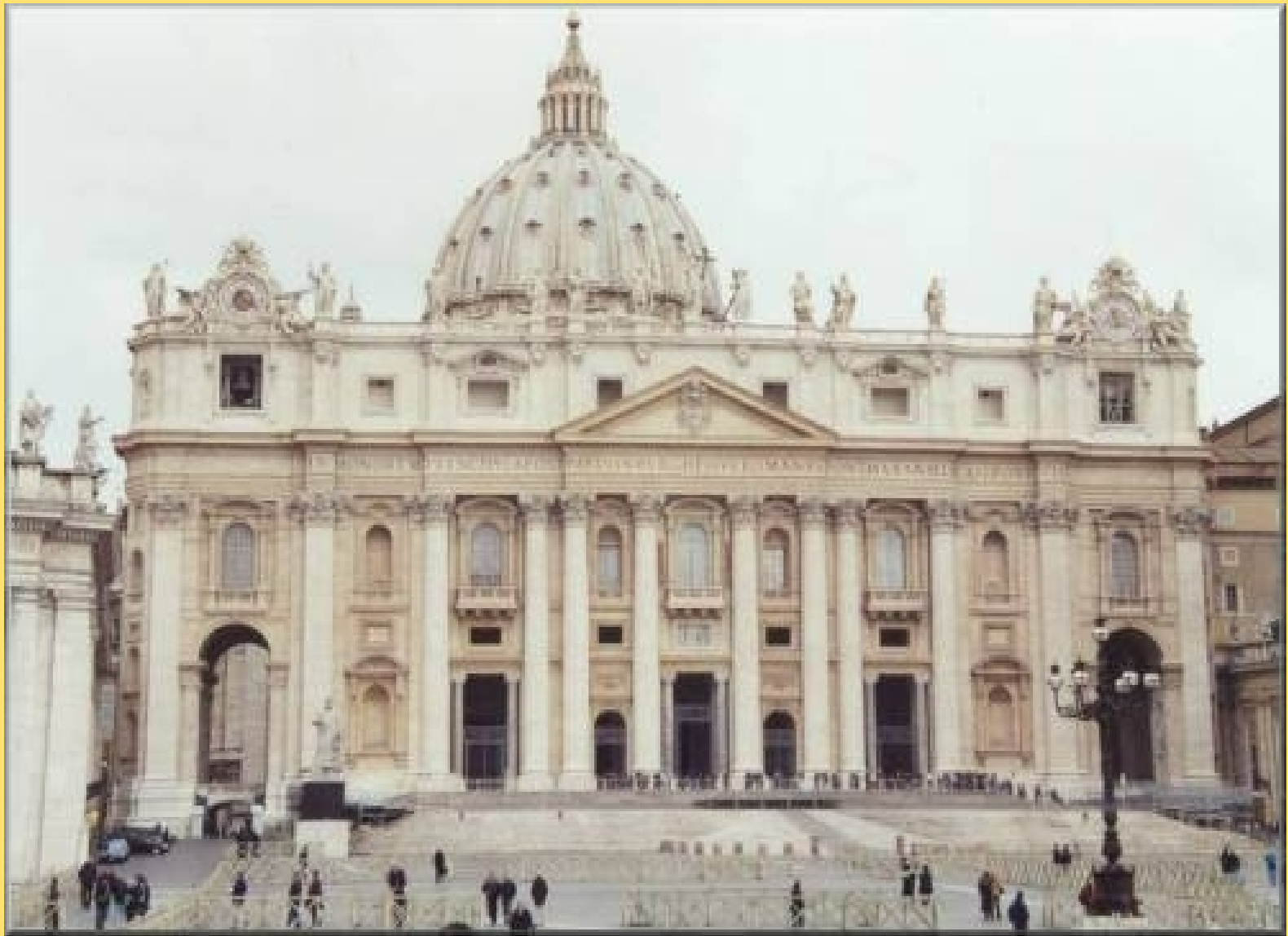
St. Peter's Basilica