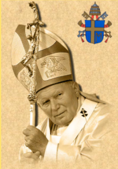
John Paul II