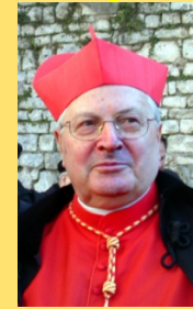
The College of Cardinals