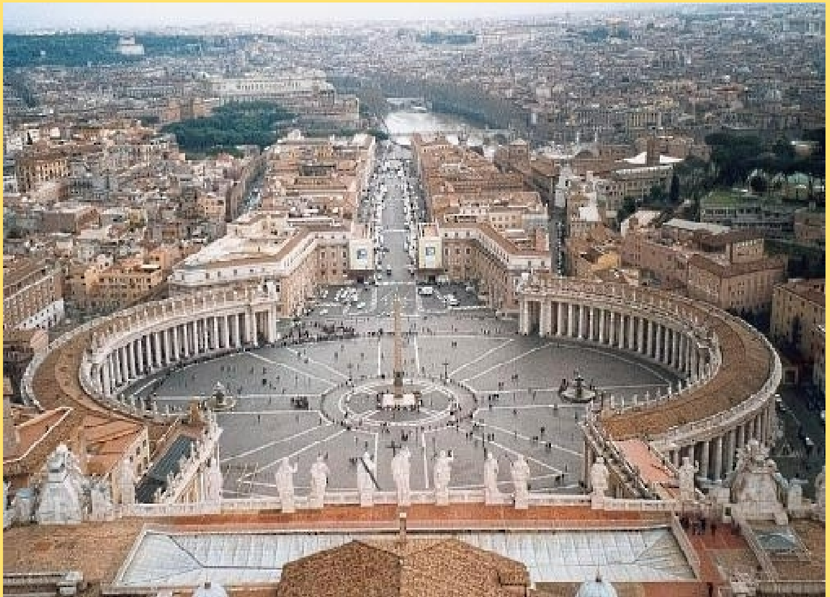
View of Rome from St. Peter's Basilica