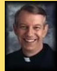
All of the Catholic priests