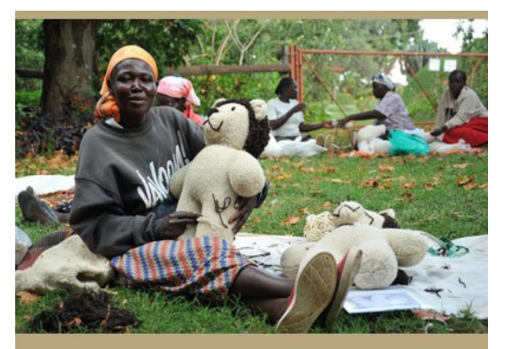
Great opportunities to help others seldom come, but small ones surround us every day.