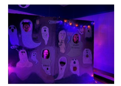
Student Council Decorations