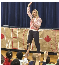
Q and A