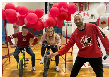
On your marks ...