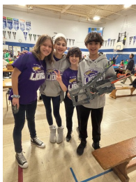
Vex Team competing in a friendly competition St. Alex