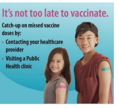
Niagara // Region niagararegion.ca/vaccines

From February 1st to 7th 2025 join, National Eating Disorder Information Centre (NEDIC) and eating disorder groups nationwide that come together to observe <u>Eating</u> <u>Disorder Awareness Week</u>. This dedicated week of action aims to educate the public about eating disorders, raising awareness of their impact, dispelling harmful stereotypes and myths, and highlighting available support for those living with or affected by these disorders.