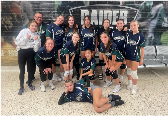
Intermediate Girls NCDSB Volleyball Champions