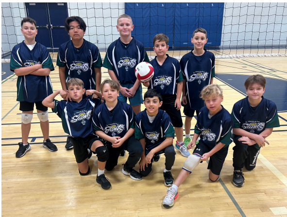
Junior Boys Triple Ball 2nd Place Finish