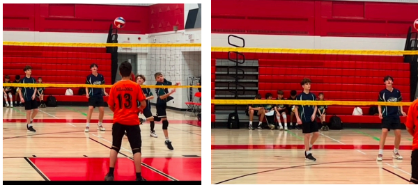
Intermediate Boys Volleyball team in action Third Place Finish