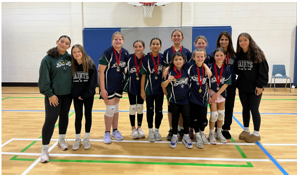
Junior Girls Triple Ball Champions