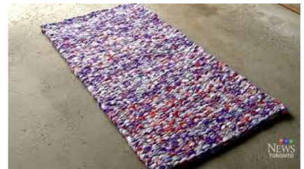
All done 😊