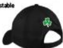
Back of Hat Embroidery

Printed with 1-Colour St. Kevin's Shamrock Logo on Left Leg