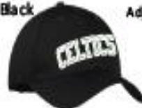
Front of Hat Embroidery