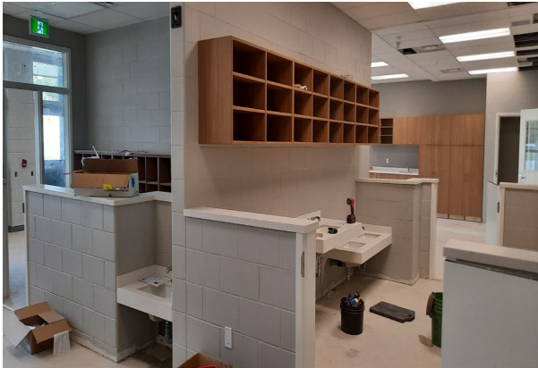
CHILD CARE - PRESCHOOL ROOM