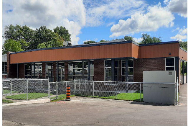
REAR VIEW OF CHILD CARE ADDITION