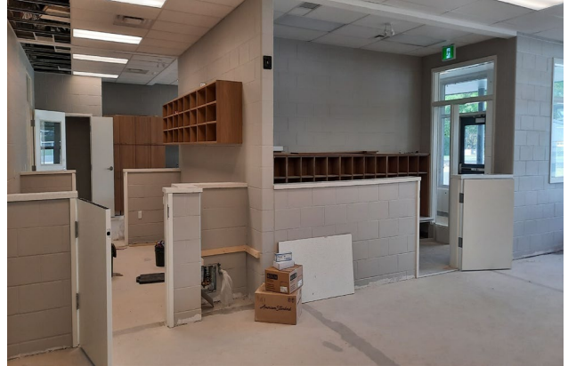
CHILD CARE – TODDLER ROOM