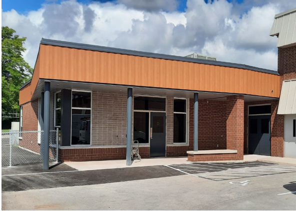
FRONT ENTRANCE TO CHILD CARE ADDITION