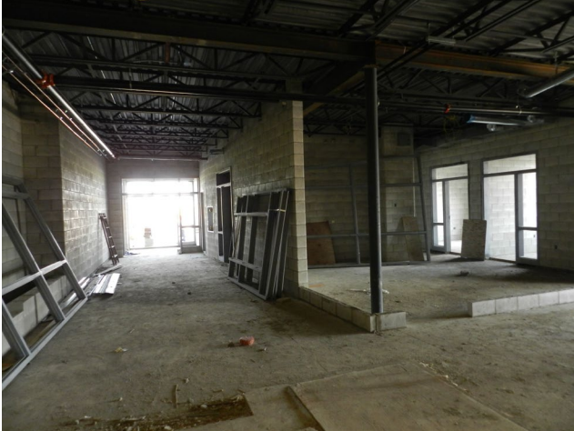
NEW MAIN ENTRANCE