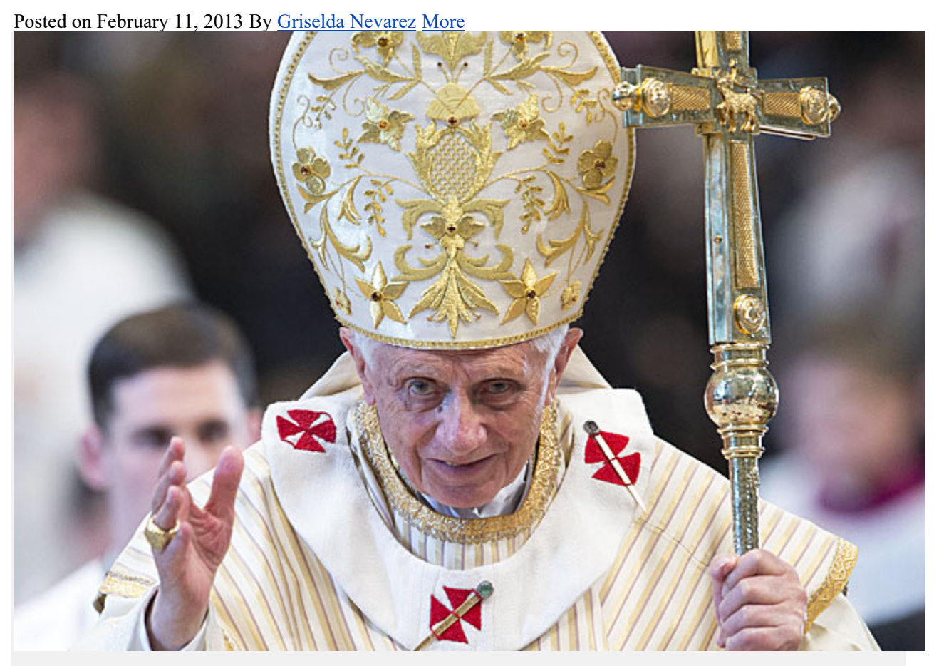
Pope Benedict XVI's announcement sets the stage for a conclave to elect a new pope.

Pope Benedict XVI has announced he will be resigning at the end of February, setting the stage for a conclave to elect a new pope.