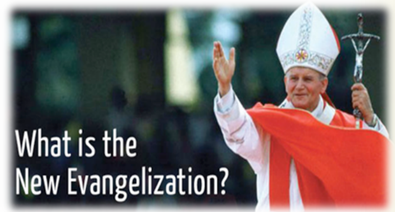
Blessed John Paul II

✧ the Church has identified that 21 st century learners require a distinctive approach to Religious Education using the approaches of the New Evangelization