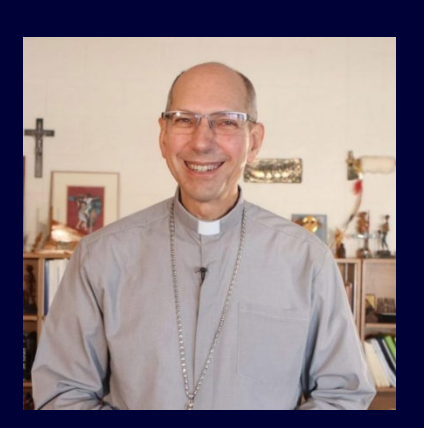
Archbishop Donald Bolen Archbishop of Regina