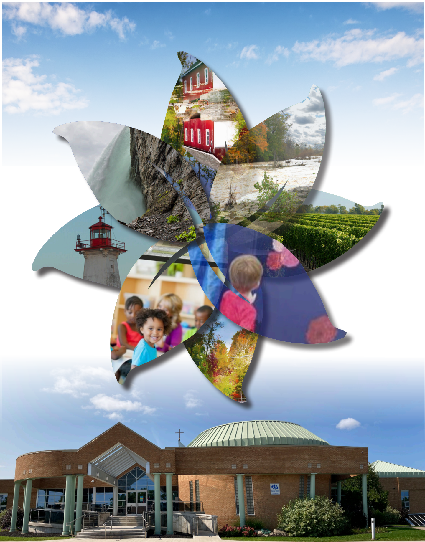
Niagara Catholic District School Board • 427 Rice Road, Welland, Ontario