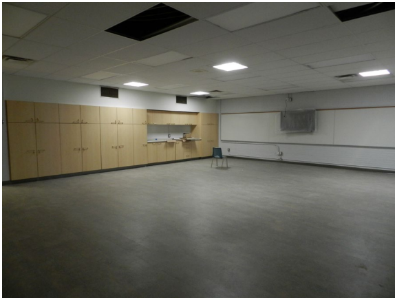
MUSIC ROOM / CLASSROOM