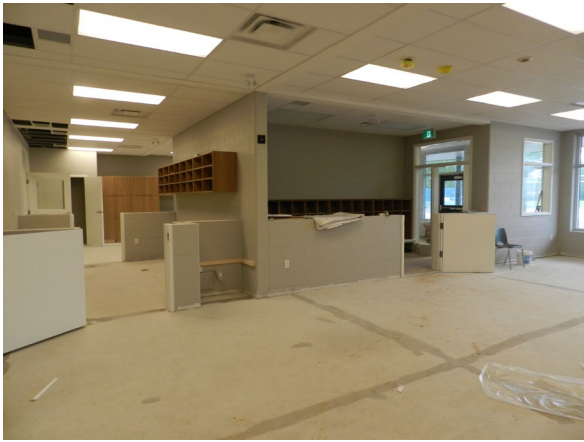
CHILD CARE - RESCHOOL ROOM