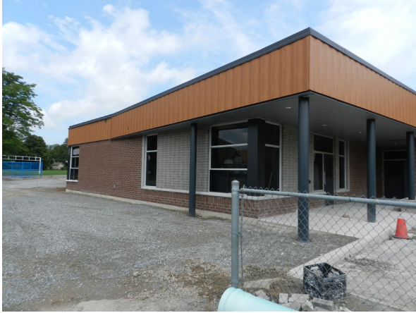
FRONT ENTRANCE TO CHILD CARE ADDITION