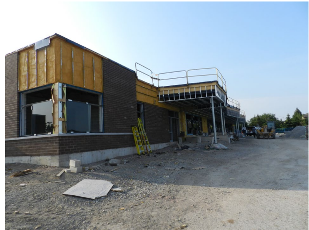
NEW MAIN ENTRANCE