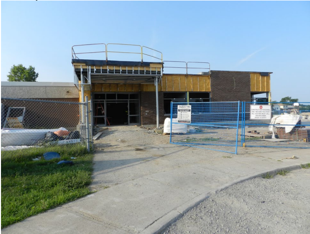
NEW MAIN ENTRANCE