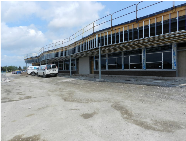
KINDERGARTEN WING – OUTSIDE VIEW