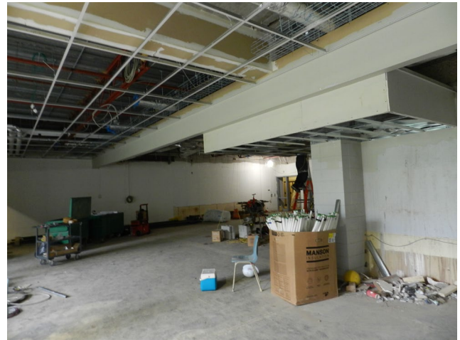
LIBRARY RESOURCE CENTRE