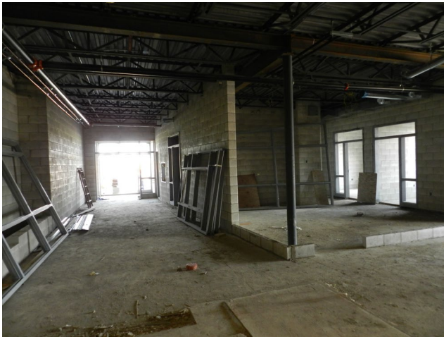
NEW MAIN ENTRANCE