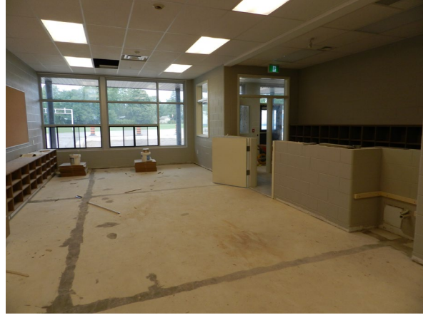
CHILD CARE – TODDLER ROOM