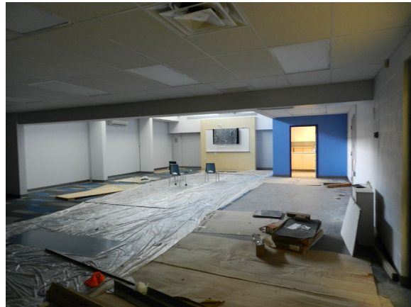
LIBRARY RESOURCE CENTRE