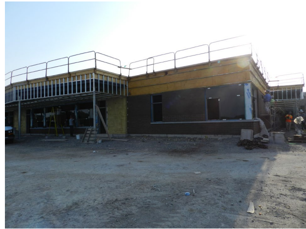
STAFF ROOM - OUTSIDE VIEW