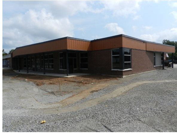
REAR VIEW OF CHILD CARE ADDITION