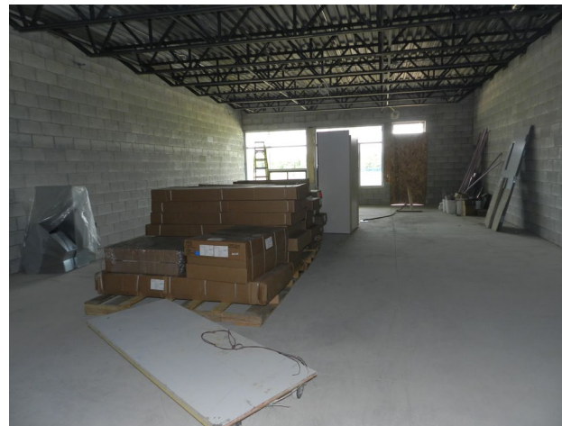
KINDERGARTEN ROOM – INTERIOR