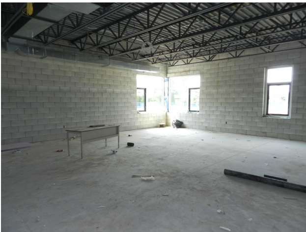
STAFF ROOM – INTERIOR