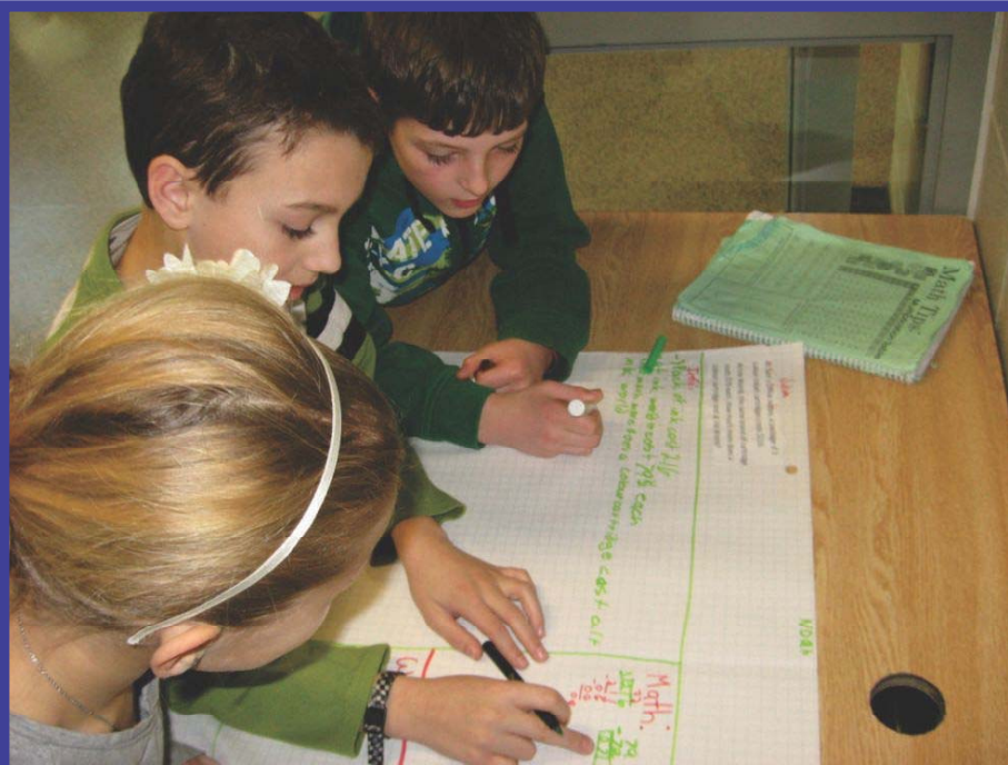
Core subjects, such as literacy and numeracy, are taught in uninterrupted blocks to enhance student achievement. Above: Students work together to solve mathematical problems.