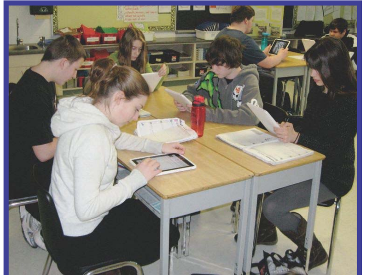
Grade 8 students at St. George Catholic Elementary School are taking part in a pilot project to use iPads as a learning tool.

There are many activities and events which enrich the social climate at St. George, making it a positive, inviting and nurturing environment for students to reach for their best. The SNAP (Stop Now and Plan) program offered through the John Howard Society and Pathstone Mental Health encourages students to consider the consequences of their words or actions before they act inappropriately.