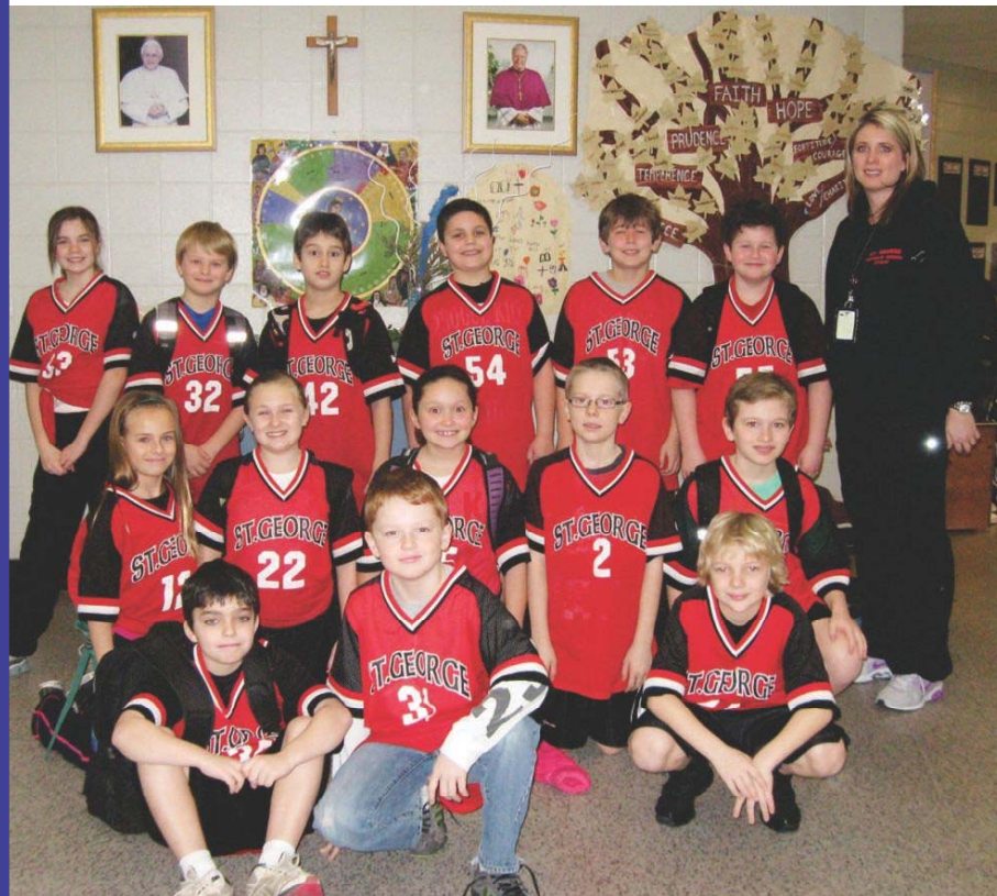
Sports, clubs and other activities are important to student development. At St. George, students are good sports both on an off the playing field and exemplify the "Play Like a Champion Today" sports program which is rooted in our Catholic values.

The school has many social justice initiatives, including the Thanksgiving, Advent and Lenten Food Drives.