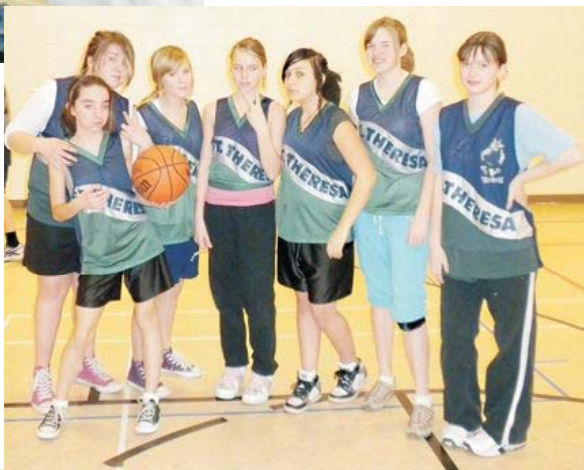
Right: St. Theresa Catholic Elementary School athletes are good sports. In this photo, members of the Intermediate girls basketball team pose for the camera.

St. Theresa staff and students have also formed partnerships with a number of organizations, such as Niagara Nutrition Partners for its snack program, and with the Niagara IceDogs, who promote the importance of working hard, staying in school and daring to dream during visits to schools.