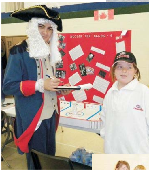
Left: Everyone gets into the spirit of things during the school's Heritage Fair which focuses on Canadian history.