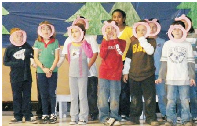
Above: Students in Grades 3-5 presented "The Three Piggy Opera" in November.

St. Theresa staff and students also participate in the annual Packs of Hope campaign to send school supplies and other items to students in need in developing nations, and support the Knights of Columbus. They also purchased gifts for 25 students this Christmas as part of the school's "Spirit of Christmas" campaign.