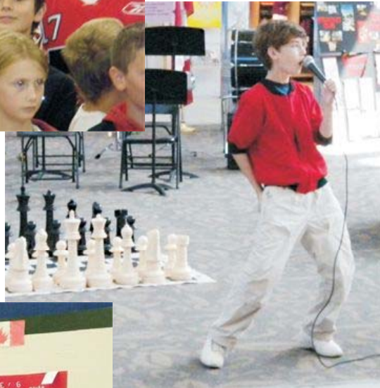
Right: Students showed off their talents at the Pen Centre during Catholic Education Week.