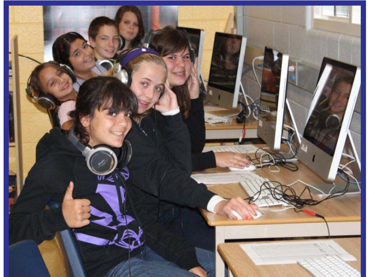
Top: Our Lady of Fatima Catholic Elementary School in Grimsby hosts one of the Board's Cyber Quest programs.