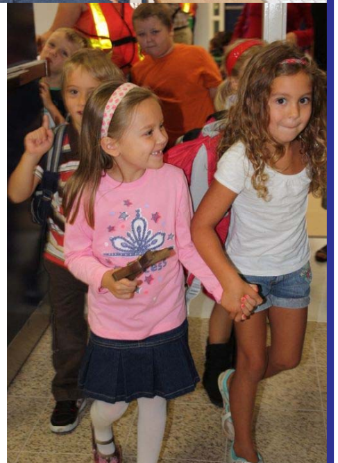
Right: The 2010-2011 school year was extra exciting for staff and students at Our Lady of Fatima Catholic Elementary School. They got their first look at the brand-new building. Following an assembly, students carried a crucifix taken from the former school to be placed in their new classroom.