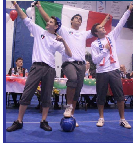
Above: Saint Paul's "Love is Louder" campaign is one of many the school undertakes each year to promote harmony, equality and diversity.