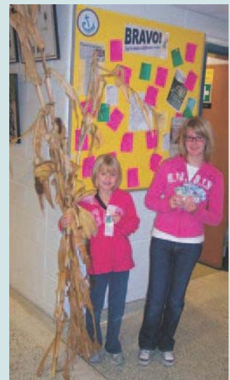
Right: The Bravo Board is displayed in the front entrance to St. Elizabeth Catholic Elementary School. It is updated daily with the names of students who exemplify the Gospel values while at school.