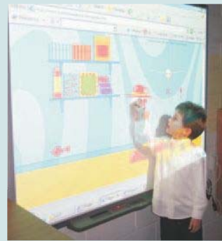
Left: St. Elizabeth is a small, rural school with state-of-the-art technology, including the new SMART board, which allows for interactive learning.