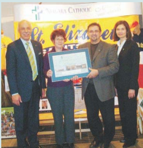
Left: Celebrating St. Elizabeth Catholic Elementary School's 50th Anniversary in November, 2009. The school celebrated with a Mass and Open House on November 8th, 2009.

Non-Catholic family members of students are invited to join in all aspects of religious programs and prayer services and Catholic character developed and integrated into all school and class activities, with those messages being reinforced at home.