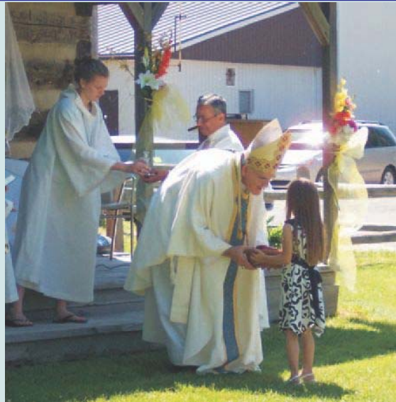
Right: Celebrating the Triad Outdoor Mass and Picnic is an annual tradition at St. Elizabeth Catholic Elementary School.

Earlier this year, students collected a wide assortment of treats and other items which were sent to Canadian soldiers serving in Afghanistan. They also collect food, toys and other donations for community members in need throughout the year.