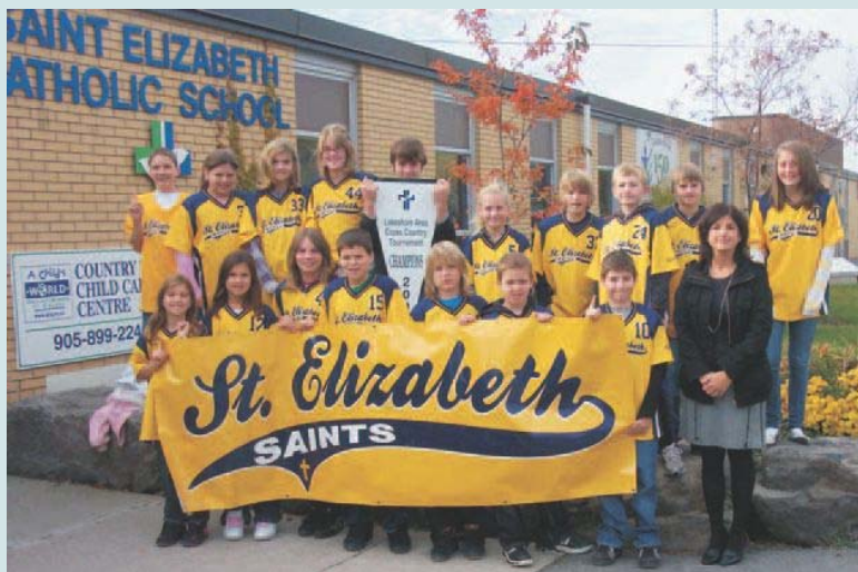
St. Elizabeth's 2009 cross-country team fared well this season, winning the Lakeshore area championship. Parent involvement helped lead the team to victory.