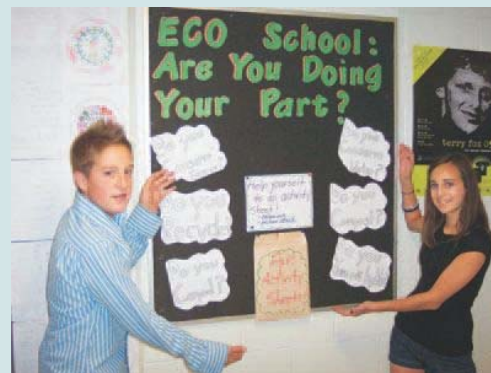
St. Elizabeth Catholic Elementary School is a Green school, working toward Gold certification in the EcoSchools Program.